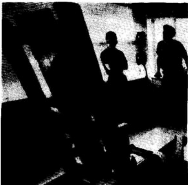
Mumia faces electric chair, still used in 15 states

Write to; PDC, BCM Box 4986, London, WC1N 3XX, or directly at; PDC, PO Box 99, Canal St. Sta., New York, NY 10013, USA.