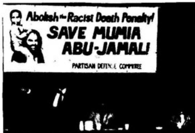
Speaker at last years rally in New York City.